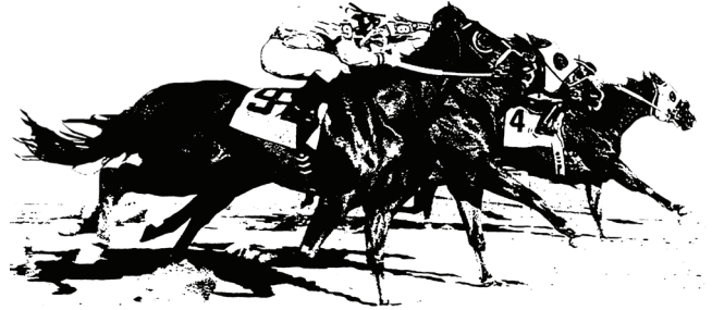
"All Quarter Horses All The Time July 3rd at Indiana Downs"